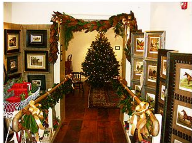
The Jacobus Vanderveer House Colonial Christmas 2011