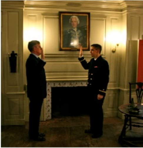
The First Salute