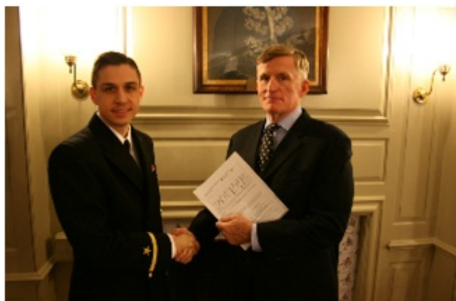
The Swearing In