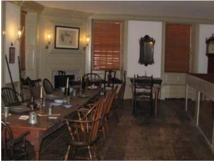
Long Room 2012

Famous for visiting patrons, like George Washington, the historic Long Room at Fraunces Tavern has been providing Museum guests with an authentic 1770s tavern atmosphere since the early 1980s. Over the past thirty years thousands of school children, out-of-towners and history buffs have stared in awe at the historic artifacts strategically placed throughout the room. In this historic room it is easy to imagine George Washington standing by the fireplace offering an emotional farewell to his officers.