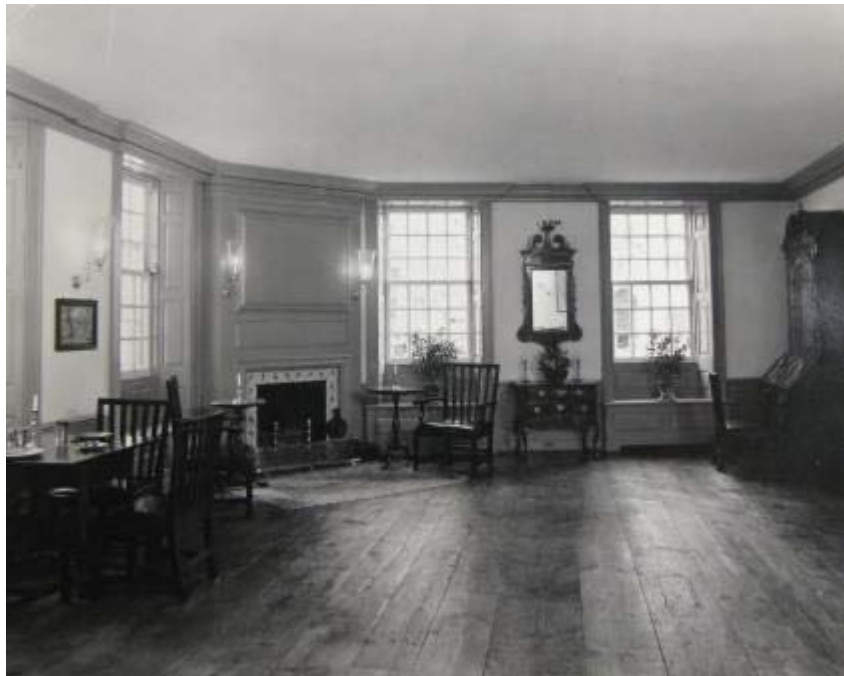
Long Room pre-1981