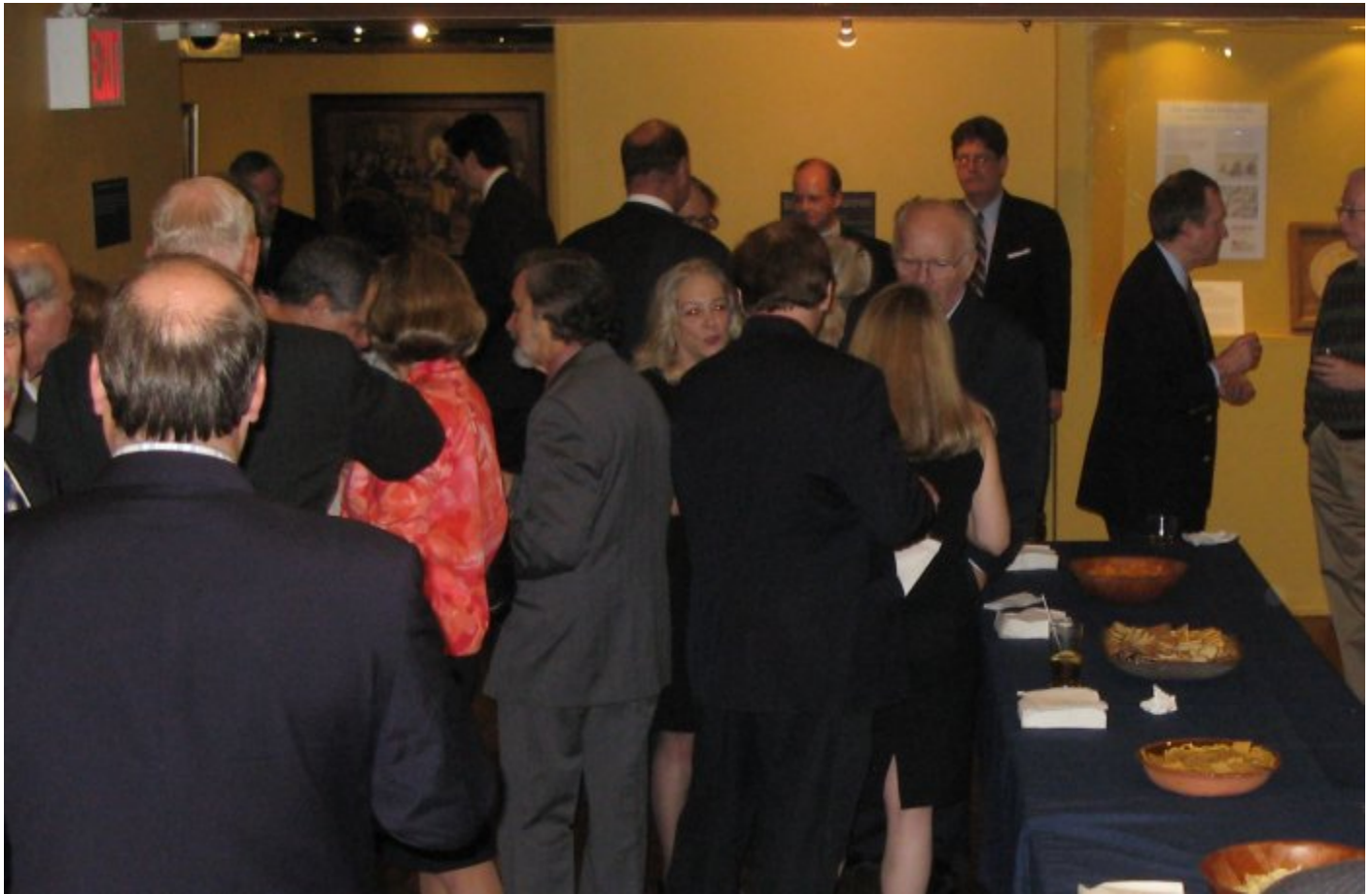
Above: Cocktail Hour

More than sixty members of the SRNY, their friends, family members, and honored guests gathered for the Family Night Stated Meeting, held on Monday April 25 th in Fraunces Tavern Restaurant; commemorating the 235 th Anniversary of the Historic Battles of Lexington and Concord (April 19, 1775). The evening's event started with cocktails in the Davis Gallery and proceeded to a welcoming family style dinner, akin to those served at the Tavern in the 1770s, in the Bissell Hall.