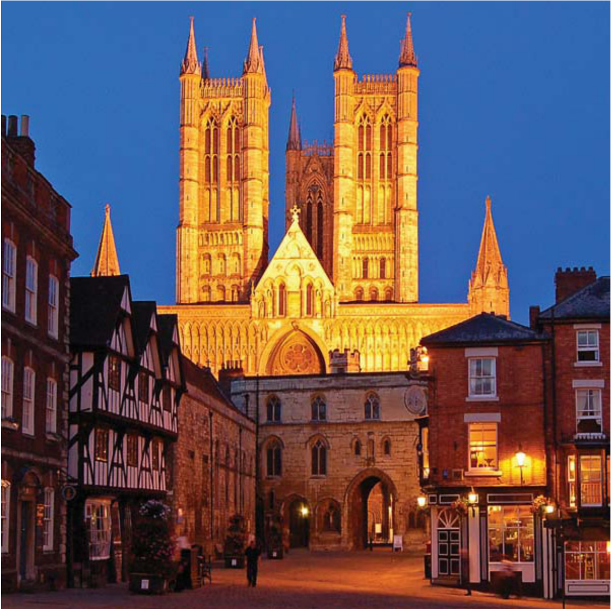
Lincoln Cathedral is the permanent home of the Magna Carta which will travel to Fraunces Tavern Museum.