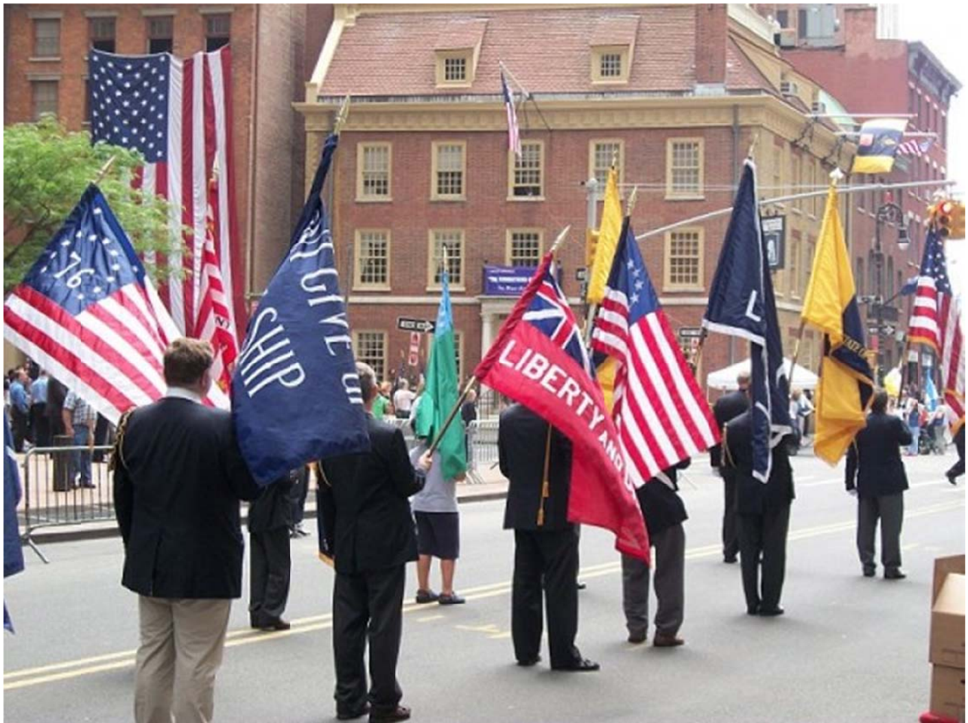
Sons of the Revolution Color Guard, with Fraunces Tavern in the background, at last year's parade.

On Tuesday, June 14th, the Sons of the Revolution in the State of New York will sponsor the 2011 Flag Day Parade. This year marks the 234th anniversary of the adoption of the American Flag by the Second Continental Congress in June 1777. The parade commences at 12 noon from