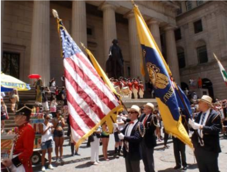
SRNY Color Guard marching in the July 3rd, 2015 NYC Independence Day Parade

The Society Color Guard marched on July 3rd in the Lower Manhattan Independence Day Parade. The event was well attended. It complimented the docking of L'Hermione at the South Street Seaport .