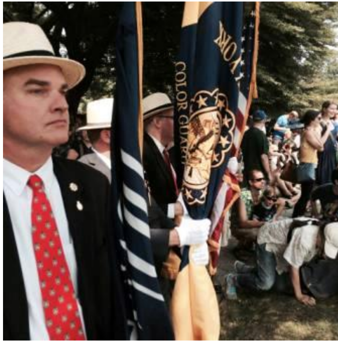
SRNY Color Guard attending the Battle of Brooklyn Commemoration