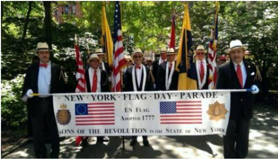
2014 Society Color Guard representing at the Flag Day Parade

Please consider becoming a Color Guard Member and showing your Society pride. Joining the Color Guard is easy - Learn More HERE .