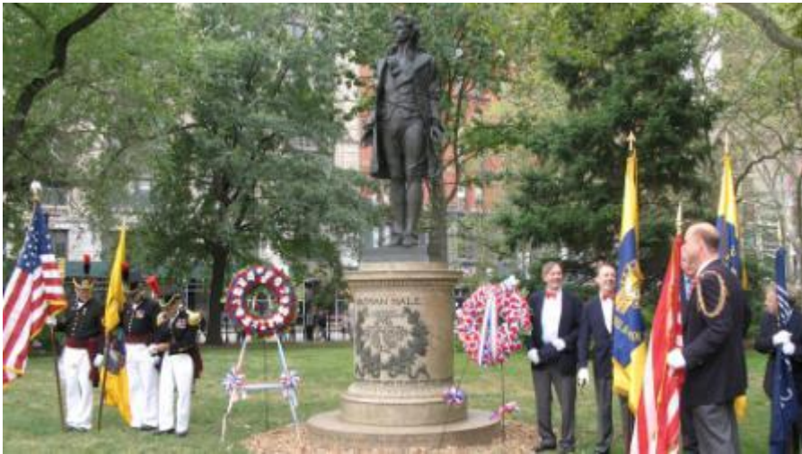
Members of the VCA and SRNY Color Guard in City Hall Park for Nathan Hale Day Commemoration 2015