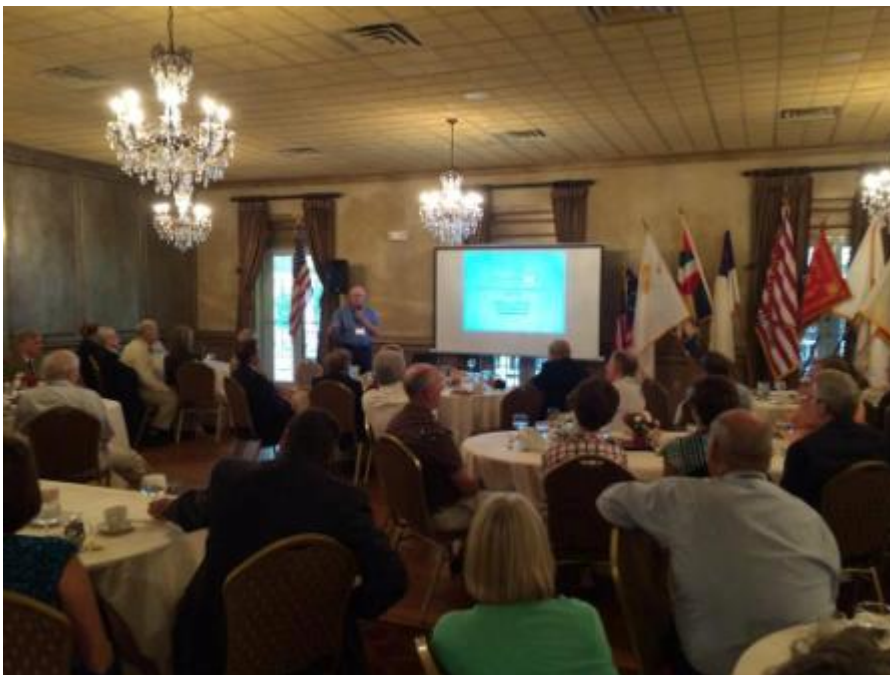
Speakers at the 2015 Battle of Monmouth Commemoration

The Society Color Guard joined the New Jersey Society of Sons in commemorating the Battle of Monmouth this summer at the battle site.