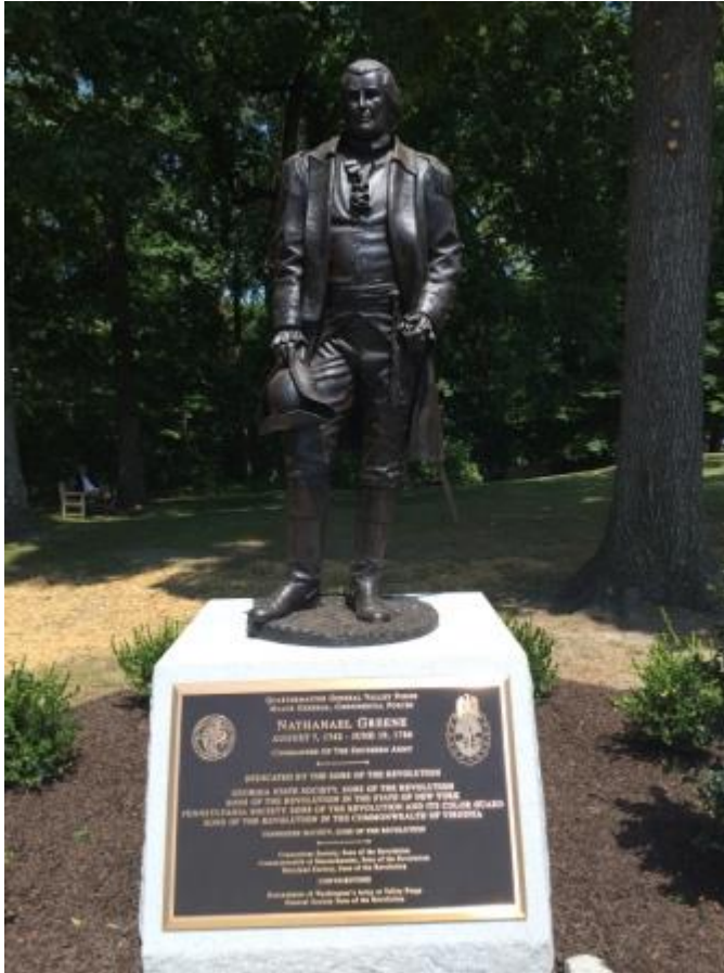
Statue of Nathanael Greene at Valley Forge

The General Society of the Sons of the Revolution commissioned a statue of Nathanael Greene, which was dedicated at a beautiful ceremony at the George Washington Memorial Chapel at Valley Forge this summer. There was a touching service in the chapel followed by speeches and the dedication on the grounds. The New York Society was a major donor to the statue.